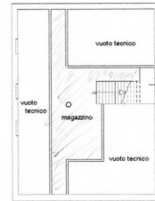
PIANO SOTTOSTRADA h = 4.50 m