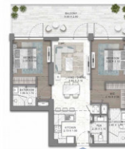
2BR - TYPE B1

Total Saleable Area: AVG: 95 SQ M / 1022.57 SQ FT