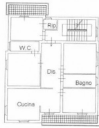
PIANO PRIMO H = 3,00 m