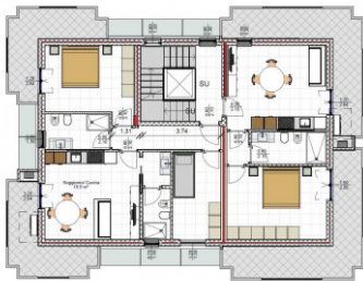
PIANTA PIANO PRIMO