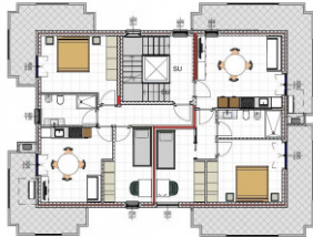
PIANTA PIANO PRIMO